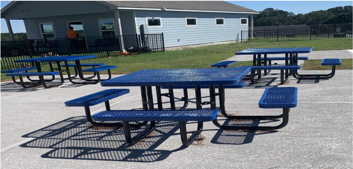
Three of the four picnic tables donated by the Beautifician Buddies for the pool area.