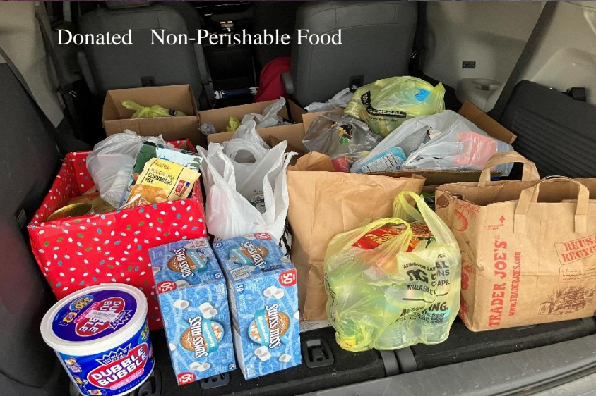
Donated Non-Perishable Food