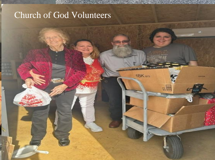
Church of God Volunteers